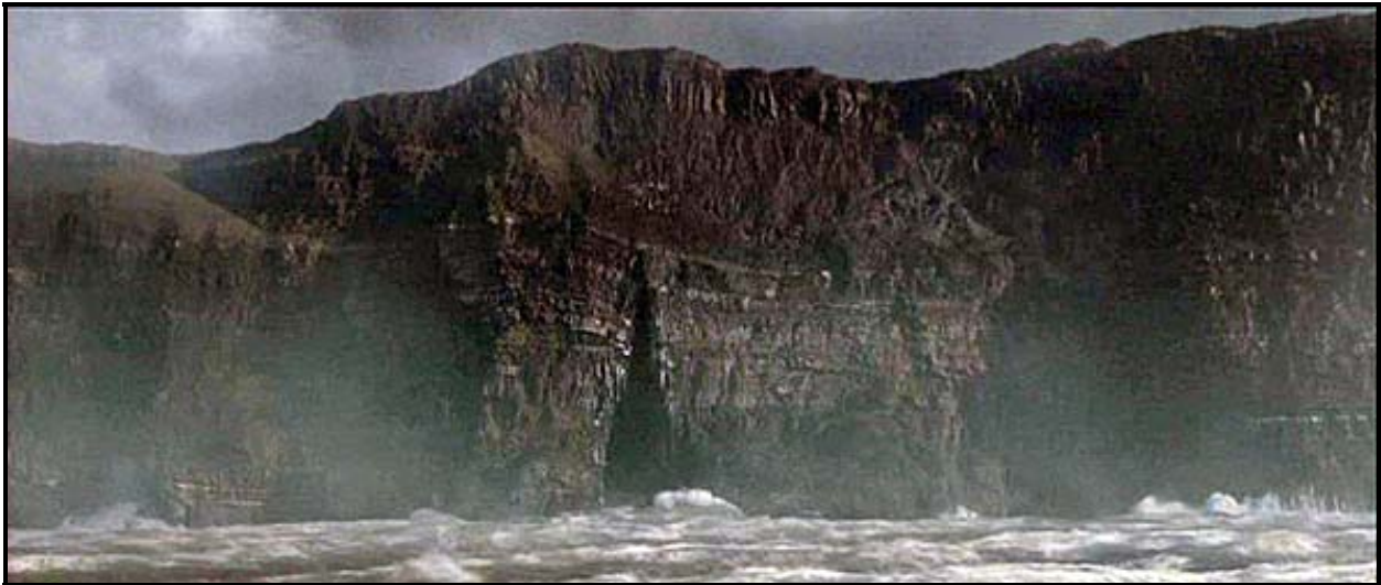
[ Half-Blood Prince screenshot (enhanced)]

At 281 meters (920 feet) above sea level, the Clo Mor Cliffs are the highest found anywhere on the UK mainland. Although they look similar to the Cliffs of Moher (an Irish HbP film site seen in the screenshot below), they are not the cliffs seen on screen when Harry and Dumbledore traveled to the Locket Horcrux Cave .